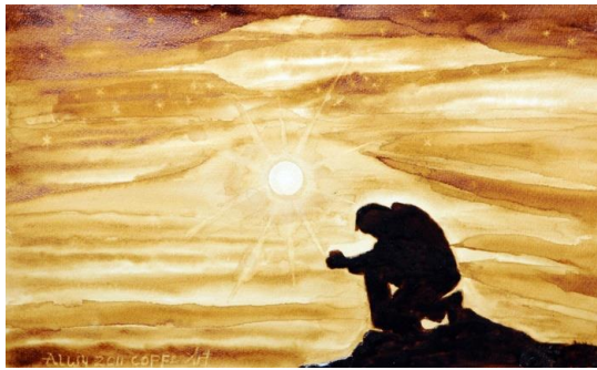
'Endurance' by Alwy Fadhel, Coffee on Paper