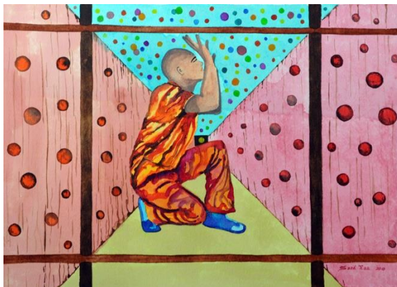
'Touching the Dream' by Saad Tlaa, Watercolour on Paper